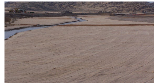
Figure 1 RECP with natural, biodegradable, wildlife, and environmentally friendly lightly woven jute netting installed across a bio-sensitive floodplain.

Extruded plastic nettings are economical, provide consistent tensile strength, may be altered to satisfy longevity requirements, and offer the only non-degradable alternative for use in turf reinforcement mats (TRMs) that are designed to be around for decades. However, as an extruded material, the machine and cross-directional filaments of these nettings are fixed at their junctures to form the mesh openings. These fixed mesh openings may pose a potential concern to wildlife, at least on a temporary basis. Large, rough-bodied snakes may be susceptible to potential entrapment. However, after sufficient netting degradation or once vegetation establishes through the RECP and the netting is drawn tight to the soil surface, potential for wildlife entrapment is alleviated.